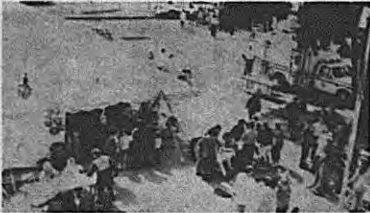
Mid-Island Hospital of Bethpage held its first community health fair on what turned out to be a glorious Sunday, October 3. Health Fest '93 was a huge success thanks to the committee whose organization and enthusiasm shone through months of planning and the torrential morning rain. Nearly a thousand participants from across Nassau and Suffolk Counties turned out to take advantage of this outstanding health care service.