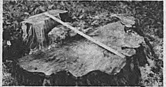
1989 - Tree stump of one of the trees in above photo. That is a yard stick across stump. The trees have since been replaced.