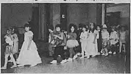
Some second graders showing off their pretty costumes.