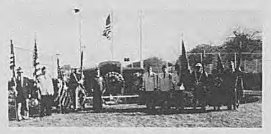
National and Post colors at attention.