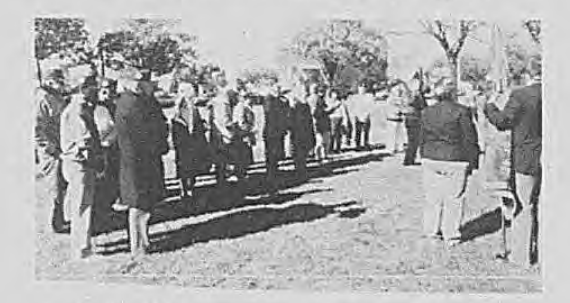
Hicksville residents and veterans at Veterans Day ceremony.