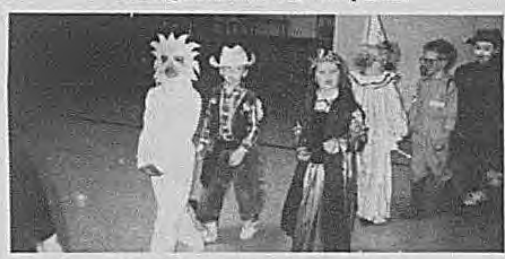
The first grade joins in the parade.