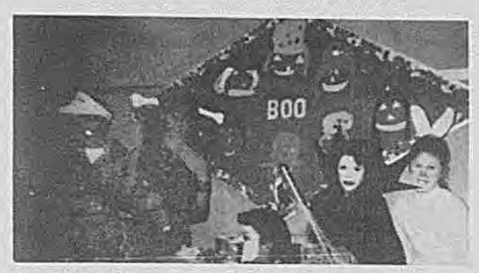
Although the rain and wind did not permit an outdoor Halloween parade at Fork Lane these sixth graders were able to show-off their creative costumes by walking through the halls.