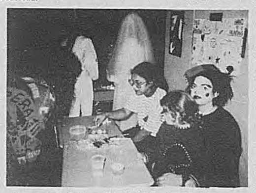
Face Painting was a popular Carnival activity.