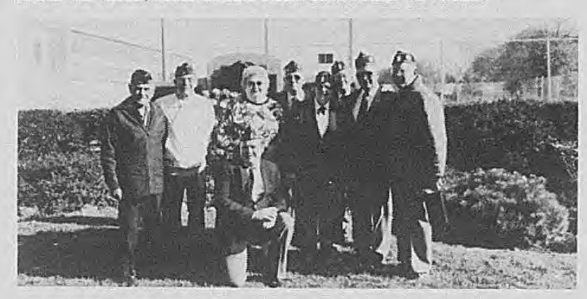
Members and officers of the Charles Wagner American Legion Post #421 at Veterans Day Ceremony.