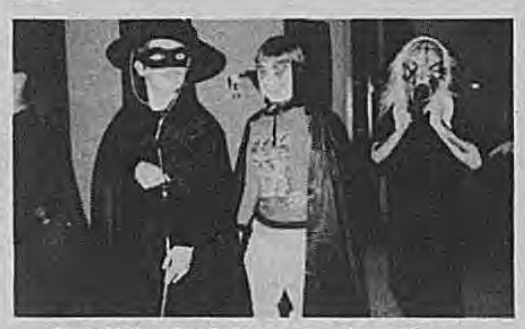
Some third graders looking scary and mysterious.

After the parade, the children returned to their classrooms for their annual Halloween parites.