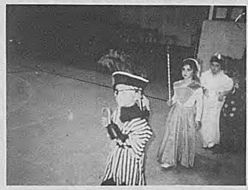
Kindergarten class leads the parade.