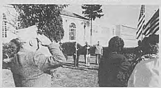
A veteran salutes his comrades at taps are played.