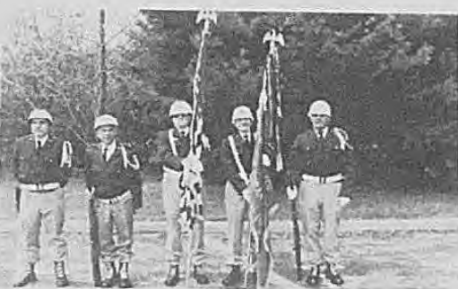
Hicksville Color Guard.