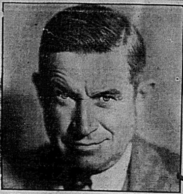
Will Rogers breaks his own laugh records in his latest film, "Doubling Thomas", which comes to the cool Bay Shore Theatre for four big days beginning Wednesday, July 21, and playing through Saturday, July 27.