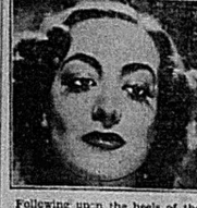
Following upon the heels of their recent success...