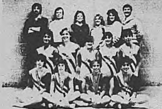
Nassau County Girls Gymnastics Team