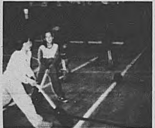
Non-stop action as students await ball.