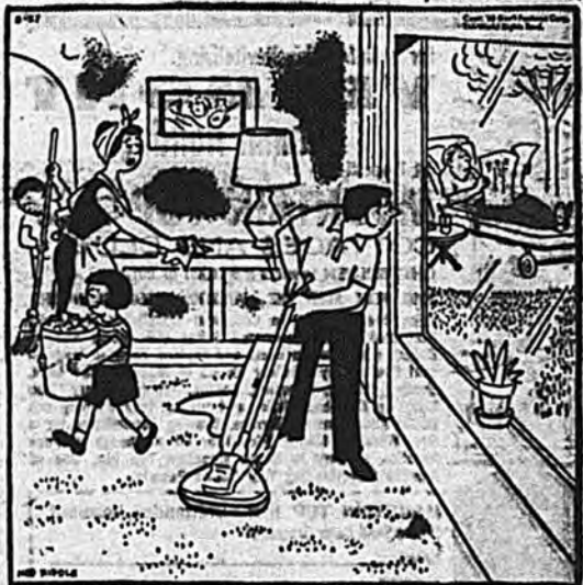
"I feel so sorry for Henry. The noise of a vacuum cleaner always seems to give him a headache."

FOR THE BEST BUY Read The CLASSIFIED CALL WE-1-0012