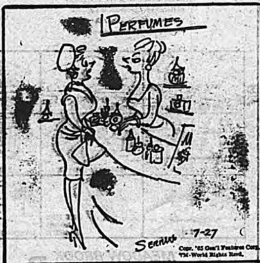
"Do you have something that contains a decongestant? He has a sinus condition."