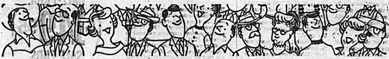
truck drivers or hairdressers? newlyweds or grandparents? city folks or farmers?

All boys and girls between the ages of 12 and 18, or attending junior high school or higher are welcome to come down to the first meeting on September 29th. Refreshments will be served and a short business meeting will be held to discuss the year's plan.