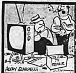
"Oh, oh... supertime! That's the 6:30 plane overhead!"