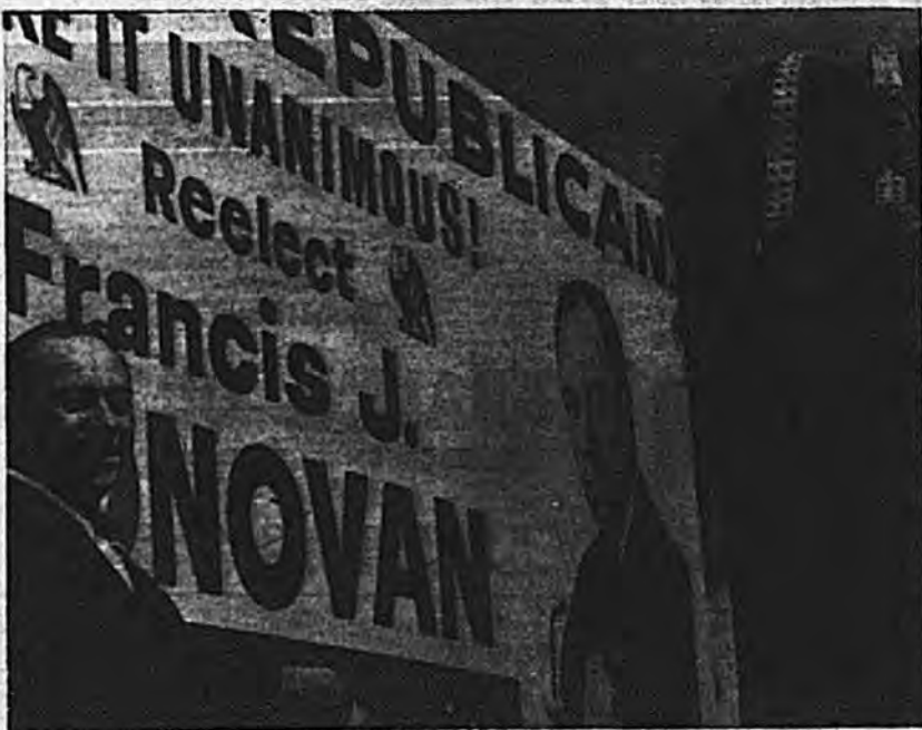
Ruth, the elephant of Animaland Zoo Exhibits acts as Republican standard bearer for District Court

The Conference will meet periodically to discuss and act upon legislation and other matters affecting the welfare of the legal profession and the public. It will also act in an advisory capacity to the Executive Committee of the State Bar.