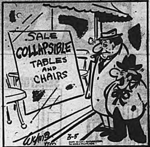
"Reminds me of my opponent... he's been writing collapsible laws for years!"