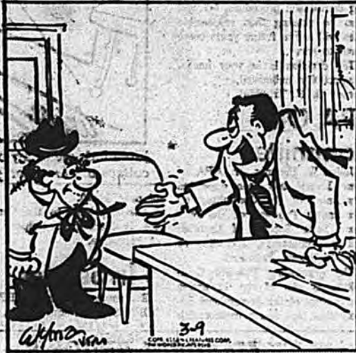
"Welcome to the Department of Agriculture, Senator — Plant it right there!"