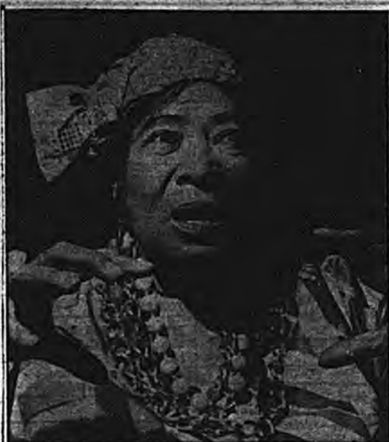
Juanita Hall, Voodoo Queen, "Katie", in Guy Lombardo's musical spectacular "Mardi Gras!" demon

strates her skill as a sorceress nightly at the Jones Beach Theatre.