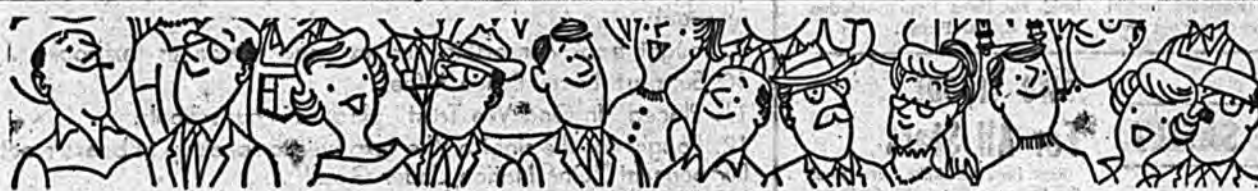
truck drivers or hairdressers? newlyweds or grandparents? city folks or farmers?