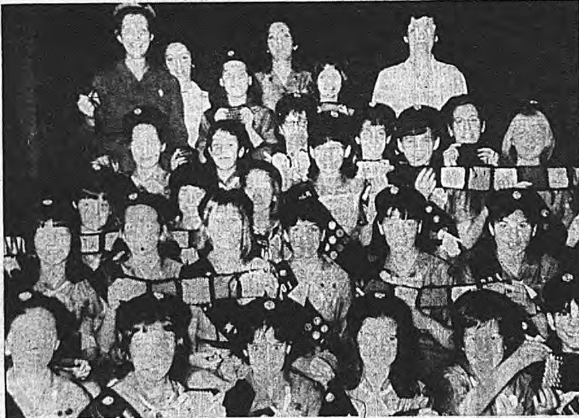
Junior Troop 301 consider wool more precious than gold! The 28 girls from Fork Lane have been crocheting knee warmers for the