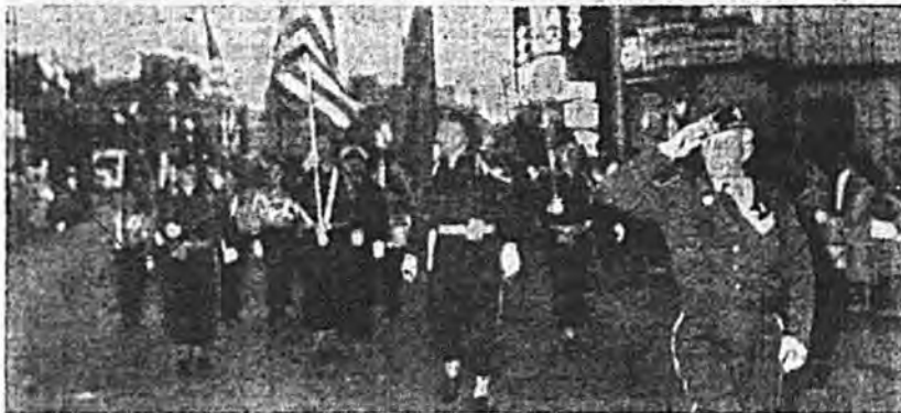
HUNDREDS of people thronged the streets of Hicksville last weekend as Hicksville's Charles Wagner Post American Legion played host to the annual Legionnaire Convention.