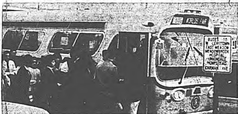
The Schenck Bus Line leaving the public by a direct route to Mid Island daily is serving the World's Fair. First day service was enjoyed mainly by teenagers on Easter vacation.