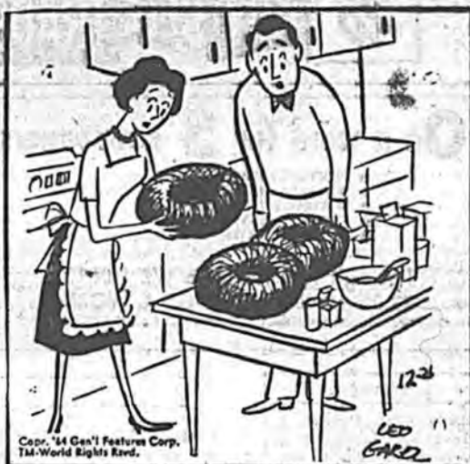
Copy: '44 Gen'l Features Corp. TM-World Rights Revd.

"How much baking powder did that doughnut recipe call for?"