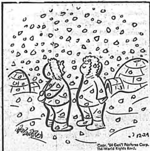
"Well, it looks like another white Christmas."