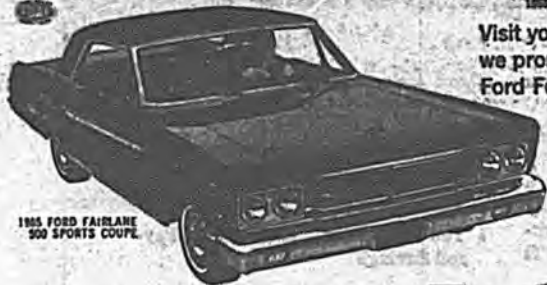
1965 FORD FAIRLANE 500 SPORTS COUPE

Visit your Ford Dealer and we promise you—you'll catch Ford Fever! It's contagious!