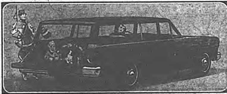
1965 FORD FALCON 4-DOOR WAGON

What you save on Ford Falcon and Ford Fairlane right now could pay for your vacation!