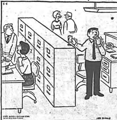
"My contact lenses? Oh, I don't wear them all the time. Right now they're soaking in that glass of water."

DRIVE CAREFULLY FOR THE BEST BUY Read The CLASSIFIED CALL WE-1-0012