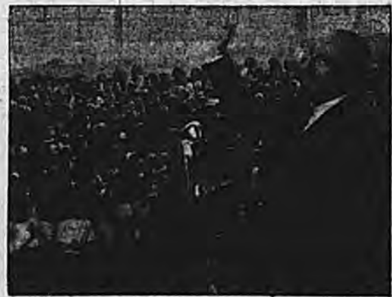
Mitch Miller drew a crowd of several thousand sing alingers Sat. night at Hicksville Sr. High School. The appearance was for the benefit of Study Inc. a group that is helping support foreign language exchange students from Hicksville

Bethpage will hold a flag burning ceremony for Boy Scout Troop 434 on Saturday, May 2, 10 a.m. at Northedge School on Stewart Avenue north of Hempstead Turnpike. All Americans are invited to bring down their old flags and dispose of them in the proper manner.