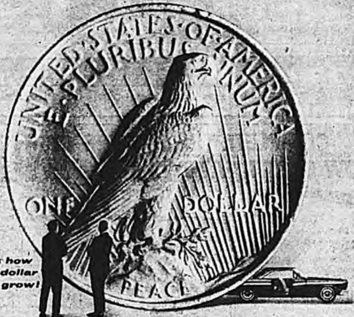
Look how your dollar can grow!