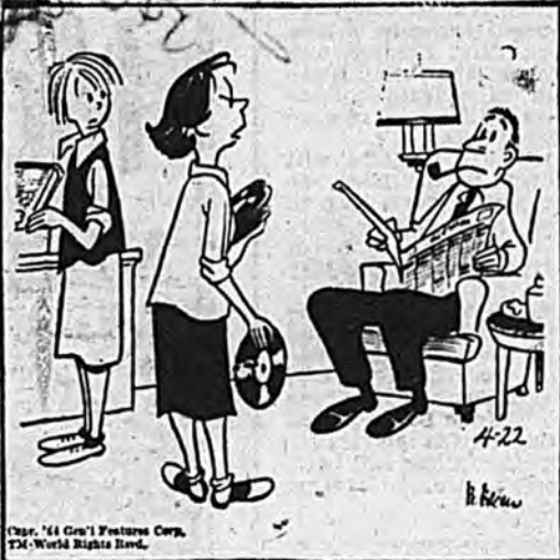
Over '64 Co.' Features Corp. TM: World Rights Reserved.

"Well, if you weren't so wrapped up in the world situation, you'd know who Fabian is."