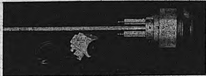
Approximately one-fourth actual size