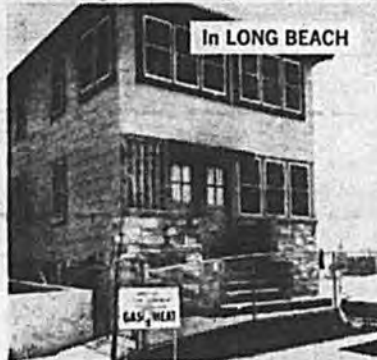
In LONG BEACH