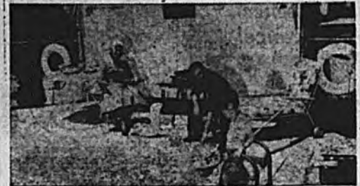
This happy family group seems to be getting full enjoyment out of inexpensive, new home swimming pool complete with bath house. Life rings are valuable added safety factors. National Swimming Pool Institute, however, cautions against use of inflatable toys by youngsters unless they are good swimmers or are closely watched. Industry group points out they can give false sense of security when not used under responsible supervision.