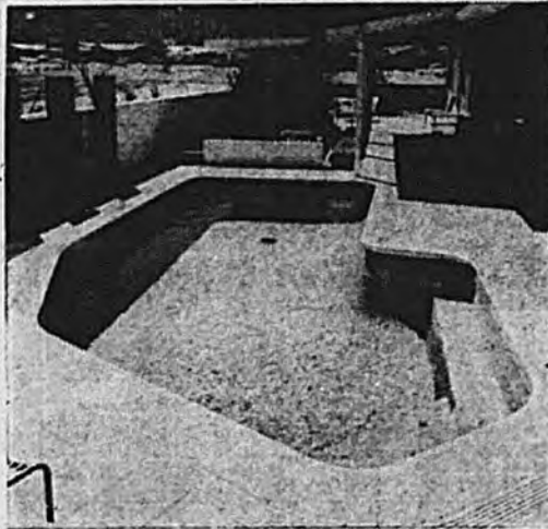
Compact 9 x 21 foot modified boomerang shape home swimming pool offers easy access and observableness from inside house in addition to forming gracious focal point for small patio. It was completed for less than $2,000, and won gold medal award in international design contest. National Swimming Pool Institute survey shows 85 per cent of home pools range from 15 x 30 feet to 20 x 40 feet and average from $3,000 to $4,700 depending partly upon geographical area.