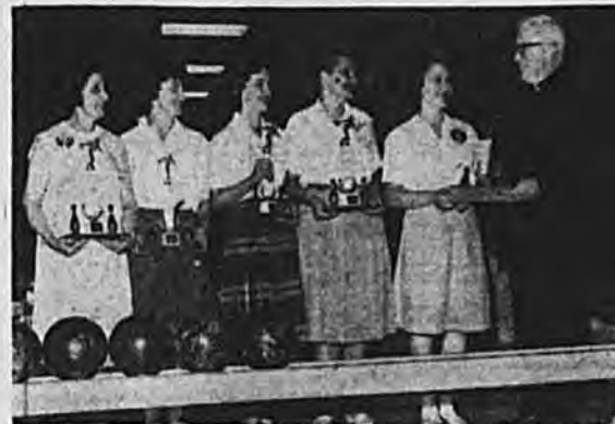
THE GIRLS BOWLING TEAM from St. Ignatius Loyola, Hicksville, won the diocesan championship from St. Cyril and Methodius, Deer Park at the Century Lanes, Huntington; Monday night, June 3. Both teams are members of the CYO Champion League. Rockville Centre Diocese embraces Nassau and Suffolk Counties.