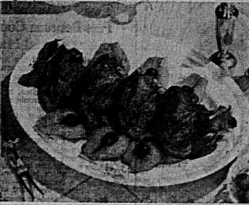
Join lamb chops with pears tinted red carry out color scheme for Saint Valentine's Day.