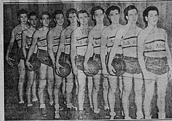
The La Salle Military Academy basketball team of Oakdale, Long Island, has started a very successful season with four wins and one defeat.