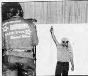
An East Street student performs in a rock 'n' roll music video.

Students from East Street School made their own rock 'n' roll music video. "Take 2", directed by Kenneth J. Marotta, transformed the students into rock and roll music video performers. Total audience participation created an atmosphere of excitement, laughter and learning to the tune of original music. Colorful, detailed scenery set the stage for the humorous production starring the students as lead singers and members of rock and roll band.