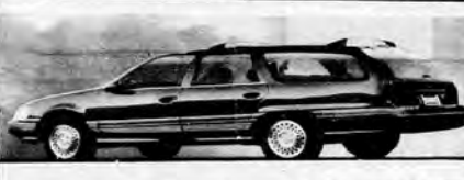
'88 MERCURY SABLE WAGON 50 TO CHOOSE FROM