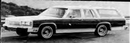
'89 STATION WAGONS