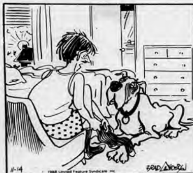
"What's the matter, pal...you traveling at slow speed this morning, too?"