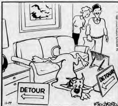
"Some of the things he brings home aren't entirely useless!"