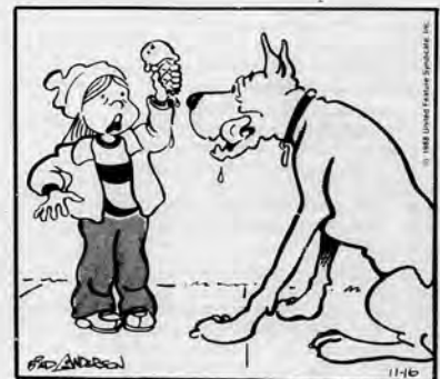
"Marmaduke! You never bite the bottom out of an ice cream cone!"