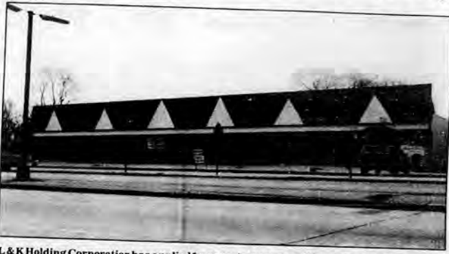
L & K Holding Corporation has applied for a special use permit to use this building, across from St. Ignatius Church, for retail purposes.