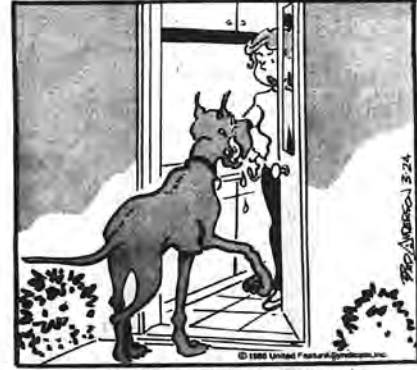
"The candy store, malt shop and bakery called - your sweet tooth is really acting up!"