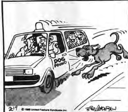
"Aren't we supposed to be chasing him?"