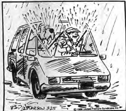
"If we run out of windshield-wiper fluid, Marmaduke will lick it clean."