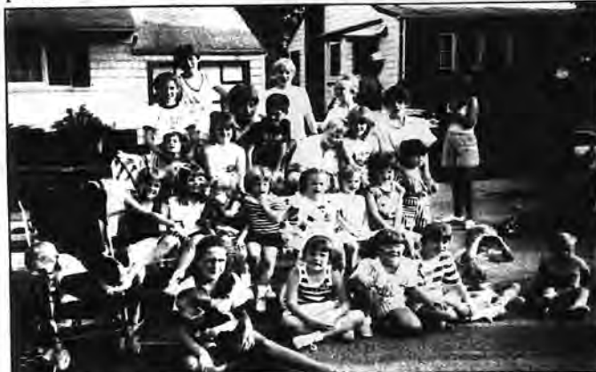
THE ABOVE SHOWS the 3rd generation of Colony Street celebrating their 13th Fourth of July block party.