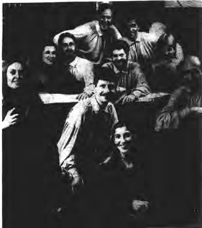
SPANISH RENAISSANCE music and Sephardic and Ladino songs will be featured at the June 28 concert at Planting Fields Arboretum. Friends of the Arts are bringing us The Waverly Consort. Call 922-0061 for information.

The Russian Choral Society is always looking for qualified singers who are interested in joining the chorus (knowledge of Russian is helpful but not required) and persons interested in supporting its research and publications work. Anyone interested in either aspect of the Society's activities is encouraged to write the Russian Choral Society, Inc., 188 Prospect St., Sea Cliff, NY 11579, or call (203) 288-2828.