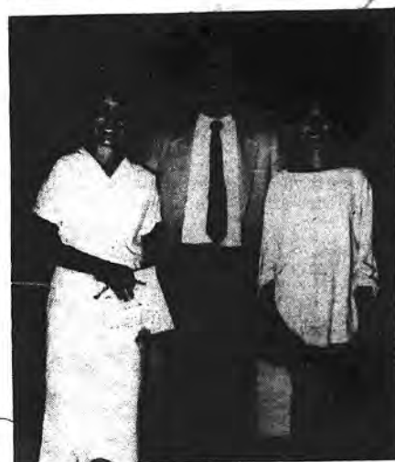
Presented at Annual Alumni Banquet held at Antun's.