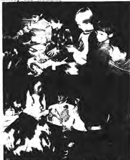
In the top picture, first graders at Lee Avenue look over some of the items on sale at the second grade bazaar. In the lower picture, third grade girls check out the jewelry on sale at Lee Avenue's second grade Christmas bazaar.

All the money collected will be donated by the classes to a worthy charity for children.