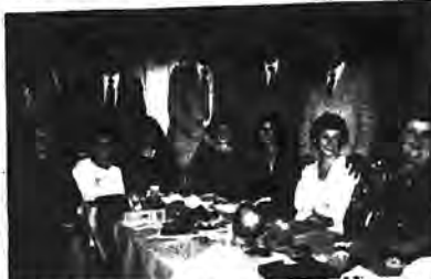
The Old Country Road School PTA hosted its first annual dinner dance, "Fall Frolic," at the Galileo Lodge in November.

The 20th Anniversary production of The Nutcracker plays C.W. Post Concert Theater for ten performances from December 26-30. For ticket information and group sales, call the Eglevsky Ballet Box Office at 746-1115. After November 23, tickets may be obtained from the Concert Theater Box Office (626-3100).