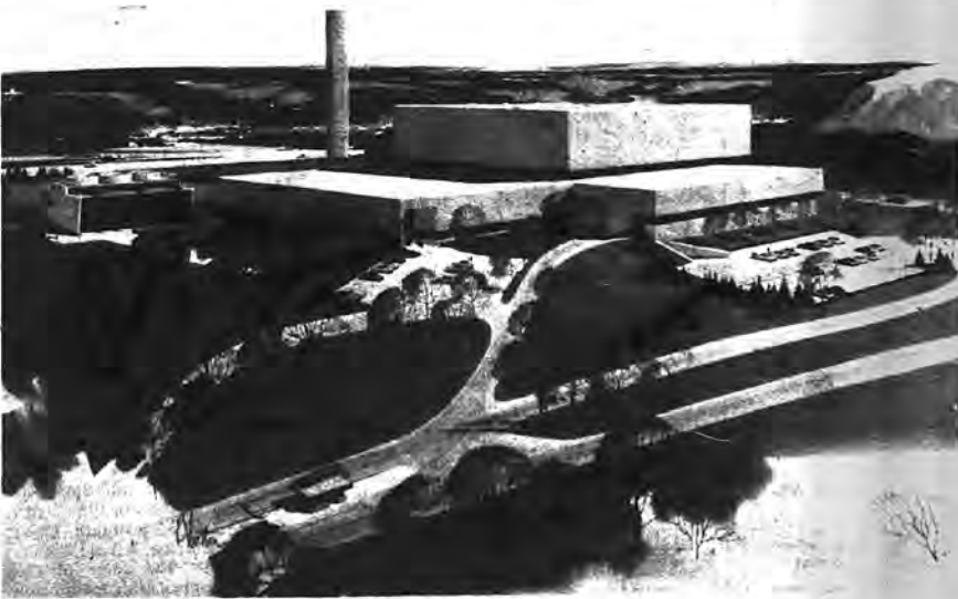
THE TOWN OF OYSTER BAY INDUSTRIAL DEVELOPMENT AGENCY (TOBIDA) has reached an agreement with Blount, Inc. for the construction of a waste-to-energy system facility (rendering of the facility pictured above) for the disposal of municipal solid waste which will service the Towns of Oyster Bay and Huntington. The Memorandum of Understanding will lead to the exe-