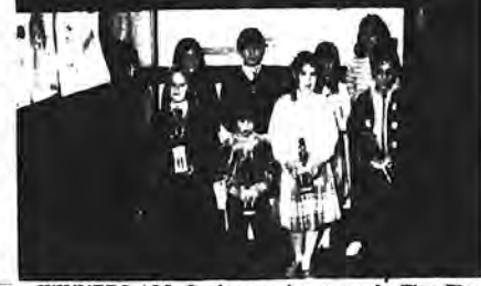
WINNERS ALL: In the top picture are the First Place winners. In the center picture are those who placed Second. In the lower picture are the Third Place winners.