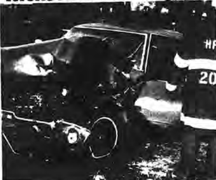
An auto accident on South Oyster Bay Rd. on November 15, caused serious injury to 2 persons and required fire and police to struggle to free them.

GAMBLE, who gave a good account of the auction held at the Legion's TUPPER LAKE camp where all kinds of equipment was sold off netting the State Legion & Tupper Lake Camp better than $100,000, and on the Auxiliary end of this same auction more money was realized ... Do not confuse this auction with the still for-sale Tupper Lake Mountain Camp property which can be had for a little more than $1,000,000 ... Do you want to buy it? ... Incidentally, the vote to increase the Dues was unanimous ... The latest of our membership to send