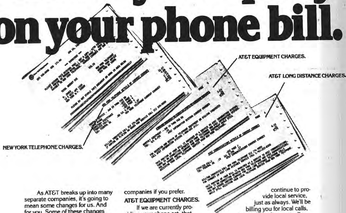
NEW YORK TELEPHONE CHARGES.