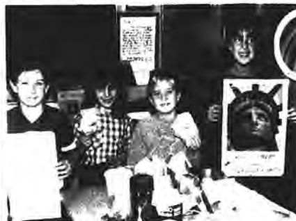
The children at Old Bethpage School went "Trick or Treating for Liberty" on Halloween. Instead of asking for candy they asked for coins so that they could contribute to the Statue of Liberty Restoration Fund. They collected over $400 for this worthy cause.