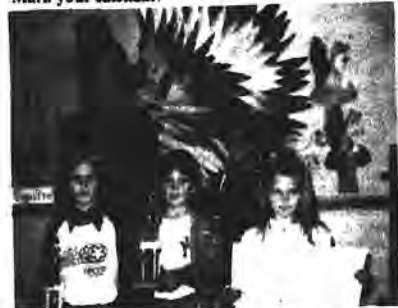
POSTER AWARDS: Four youngsters from Fork Lane School received trophies for their outstanding posters during Fire Prevention Week. They were also treated to a reception at the Fire House.

You will really enjoy this important community meeting! Mark your calendar.