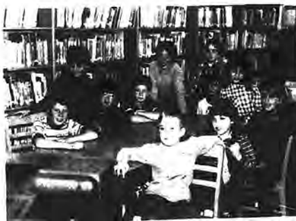
Student Council Candidates at Old Bethpage School