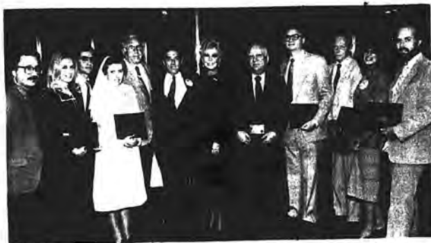
Area Hospitals receive Special Recognition at Annual Meeting and Awards Ceremonies of the American Heart Association/Nassau Chapter.