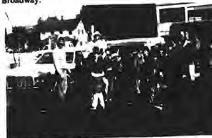
Cub Scout car wash, a success! Cub Scout Pack 491 of St. Ignatius, Hicksville, held a car wash on Oct. 29th. Funds raised will be used to offset costs of trips and awards for the scouts.

Hicksville Republican club. 8:30 p.m., VFW. 320 South Broadway.