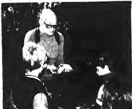
The guide shows the children earthworms and describes their role in soil ecology.

The guides helped the children discover facts about the formation of soil, plant decay, pond life and different kinds of plant life. They also discovered places where animals might live