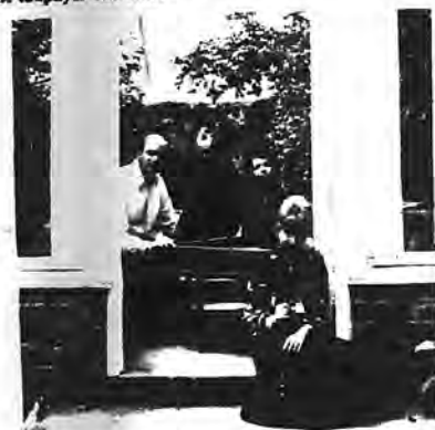
CHAMBER & JAZZ: The Nassau County Office of Cultural Development, will present the Auburn Collegium in a program of "Chamber & Jazz" on Sunday, November 13 at 3:00 pm at the Plainview/Old Bethpage Library, 999 Old Country Road, Plainview.