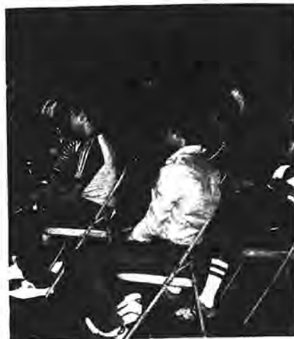
Several of the "New Image" recruits watch a marching demonstration during a recent rehearsal.

New Image, which is an outgrowth of the famous St.