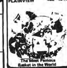
The Most Famous Basket in the World

HICKSVILLE 931-5343 OLD BETHPAGE 433-1517 PLAINVIEW 433-1517