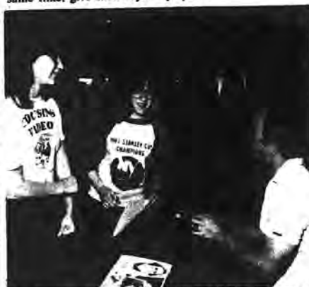
TWO YOUNG N.Y. ISLANDER FANS happily receive their autographed photo of star player Butch Goring during his appearance at the Stadler Shoe store, plaza at Mid-Island Mall, Hicksville, N.Y. The exciting young ladies were among hundreds of dedicated fans that turned out to meet Goring during Stadler's salute to the Islanders.

fans an opportunity to personally meet one of their star players."