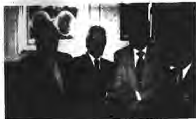
Congratulations all around was the order of the day at the April 13 meeting of the Hicksville Kiwanis Club when recognition was given to four past presidents in honor of a variety of accomplishments.