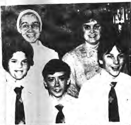
MATH BEE AT HFS: Recently students in the 4, 5 and 6th grades at Holy Family School in Hicksville competed in their annual Math Bee.