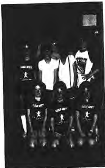
Hicksville Jump-A-Thon: The East Street School winning team proudly poses for a photo at the end of the JRFH event.

So roll back the stone of any unbelief in your hearts, behold the glory of the empty tomb, and thrill to the power that can now be yours. Place your weak and trembling hand into His and say with Thomas, "My Lord and my God." Belief in Jesus and his resurrection is the key that delivers us from fear and sorrow. Jesus is the key to personal happiness, to peace, and to life everlasting. You can know this peace, you can know this joy, you can have this power, if today you will commit yourself to him, and then say with your whole heart, "I know that my Redeemer lives!"