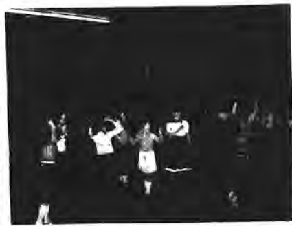
Nothing brings dads and their little girls together like the Annual Girl Scout Father-Daughter Square Dance. It's hard to tell who enjoys it more; the dads or the girls. This year, the event has become so popular that two different dances were held to accommodate ticket requests.