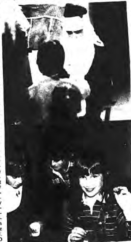
HOLIDAY CELEBRATION AT THE HICKSVILLE LIBRARY: This past season was a joyous one at the Hicksville Public Library. Candy making, holiday crafts, magic, and puppets were all part of the month long celebration in the Children's Room. The many holiday events concluded with a surprise visit from Santa Claus.