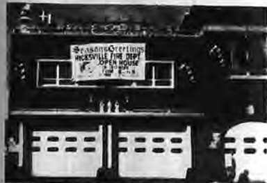
Main Fire Station on E. Marie St. Hicksville all set for Santa's visit on Sunday Dec. 7th from 2-5 P.M.