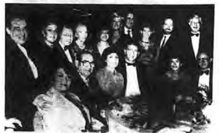
Members of the Zionist Organization of America's Long Island Region attended the group's 85th annual convention held in Baltimore, Maryland, in the early Fall.

$100., share of profits/losses 1%. LP not obligated to make additional contribution. LP's contribution returned upon dissolution of partnership. LP may not assign etc. interest except per certificate. GP may admit additional LPs. No priority among LPs for repayment of capital contribution. Any remaining GP may continue partnership business per certificate. LP has no right to demand and receive property other than cash in return for contribution. (P-10-1-2-87)