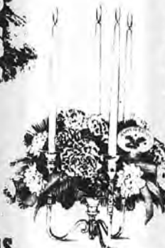
Teleflora's Porcelain Centerpiece Bouquet.