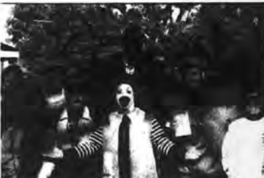
Members of the Plainview-Old Bethpage Road Runners Club pitched in with Patrick Ewing and Ronald McDonald to help stage the 1st annual "Ronald McDonald House Love Run" in Eisenhower Park on November 16. More than 300 local runners participated, and all proceeds went to Ronald McDonald House.

Rd., Mt. Sinai, NY, cash contribution $100., share of profits/losses 1%. LP not obligated to make additional contribution. LP's contribution returned upon dissolution of partnership. LP may not assign interest except per certificate. GPs may admit additional LPs. No priority among LPs for repayment of capital contributions. Any remaining GP may continue partnership business per certificate. LP has no right to demand and receive property other than cash in return for contribution. (P-11-1-2-87)