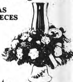
Teleflora's Holly Hurricane Bouquet.