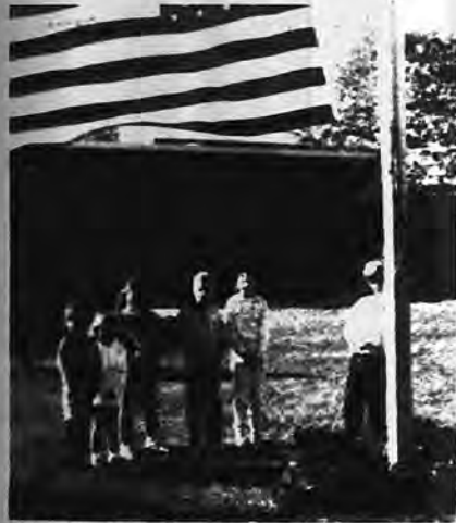
The children of Good Shepherd Lutheran School in Plainview are proud to help put up their brand new American flag given by Congressman Norman F. Lent.