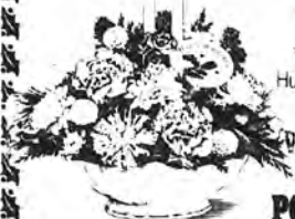
Teleflora's Brass Candelabra Bouquet.