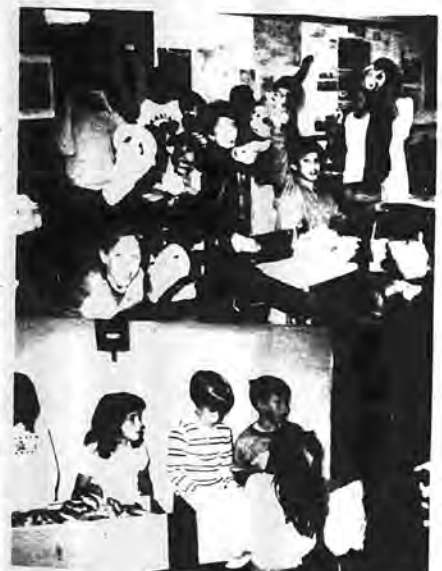
On Oct. 8, all the children at Lee Ave. School were seen munching away on pretzels, as the 6th grades held their 1st pretzel sale. The sale was sponsored by the PTA and all the proceeds are going to help defray the cost of the 6th grade yearbooks.

183 South Broadway, Hicksville, N.Y. (516) 931-0441 ONE BLOCK NORTH OF OLD COUNTRY ROAD Monday-Friday 9 to 5, Saturday 9-6, Closed Sunday