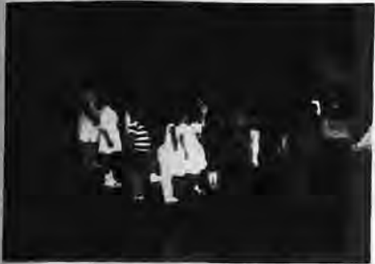
The first grade students singing "We Are The World" to their grandparents, was a very special part of this program.

The grandparents were also entertained in the grandchild's classroom. A grand time was "had" by all!