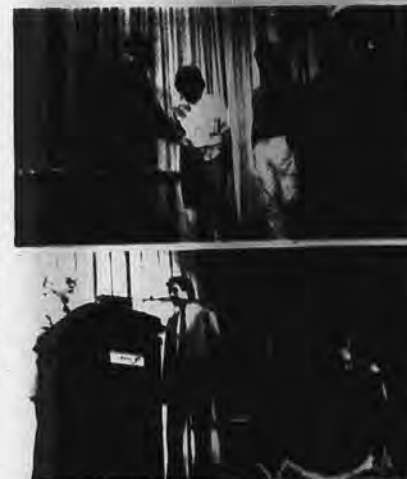
Here are two pictures taken at the Hicksville H.S. Marching Comets Award Ceremony on June 2, 1986.