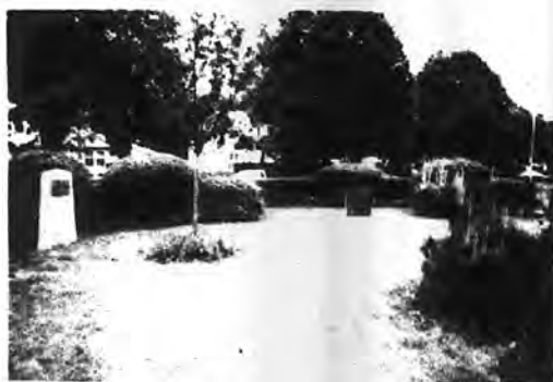
These are models of the Korean & Vietnam Monuments.

If you want to help you can make a donation to the Hicksville Veterans Monument Fund, P.O. Box 412, Hicksville, NY 11802. It will be tax-exempt.