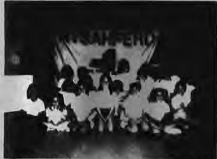
On May 6th the third grade students of Dutch Lane School Hicksville participated in "Showcase 86" at the Sunrise Mall in Massapequa.

Atlantic City - Harrah's Marina & Casino (On the Bay), Wednesday, June 18; 9 am. $10 per person. Bonus: $5 in