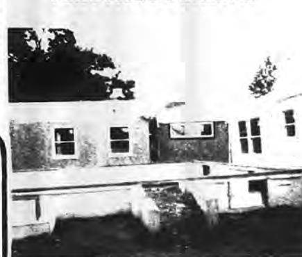
AS WE GO TO PRESS: Today's first modular home is delivered on site and will be erected soon on Raymond Ave. Hicksville, near Old Country Rd. The house is said to have 14 rooms and can be erected in one day.

Matty O can be enjoyed: (a) a run. The show the roads lead to.