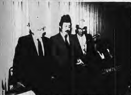
Awards were given to the 3rd and 4th Grade Classes of the Hicksville Public Schools, Holy Trinity School, Trinity Lutheran School, Our Lady of Mercy and St. Ignatius School for winning entries in the V.F.W. Coloring Book Contests. Awards nite was held at the V.F.W. Hall on May 20, 1986.