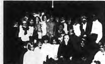
Scrooge, (a Changed man). The students displayed exceptional acting talents, their singing and dancing were exquisite. The costumes and makeup were spectacular. The cooperation of the parents and teachers was a considerable help to the performance of this fine show.