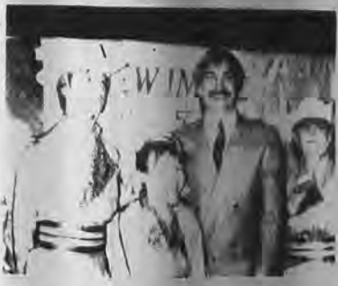
Bobby Nystrom, of The New York Islanders, is extending a helping hand to New Image, a living legend in the world of drum and bugle corps. In this picture we see Mr. Nystrom with Corps members at a fund raising auction in 1984.

sonal sacrifice produce excellence - and their Corps is the best of its kind on Long Island as a result of these lessons. It's inconceivable to me that, with their incredible track record, they should have any problem finding a new home. Any organization, school or church would be fortunate to have them... And I'll do anything I possibly can to keep this exceptional group of kids from going down the tube for lack of a place to call 'home'."