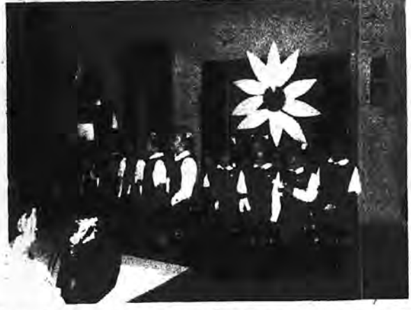
Guess what's new at St. Ignatius Loyola School, and, in fact, in ALL of Hicksville? DAISY GIRL SCOUTING!!