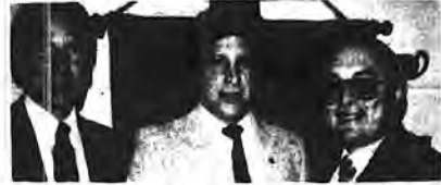
Big doings at the October 9 meeting of the Hicksville Kiwanis Club!