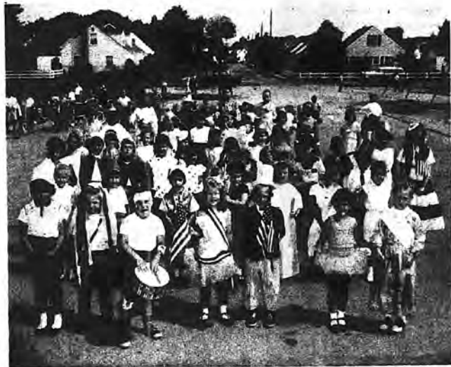
IT WAS SOME TIME IN THE EARLY 60's, we think at the East St. School. And, this we know.

Do you know the names of some of these youngsters and where they live now? Drop us a line, or phone us at 931-1400.