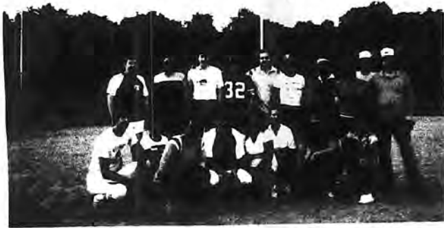
The Hicksville Post Office "Zips" went to bat once again to help improve the quality of life for persons with disabilities at this year's Annual Easter Seals Softball Benefit held at Cantigue Park.

Come and take a stroll with us, "Down Memory Lane."