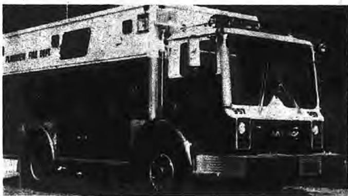
Pictured above is the Plainview Fire Dept's truck #957.

Power was also supplied to a room in the west wing to main-