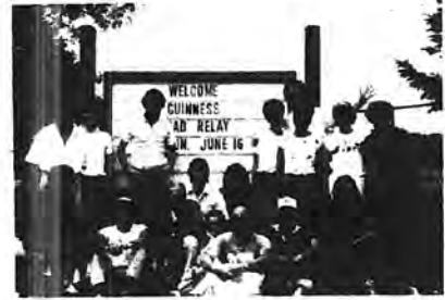
POBRRC's Relay teams share a moment of well-earned relaxation after successfully reaching the Mahopac finish line.