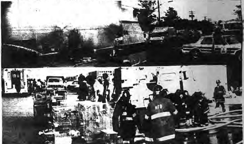
Top left: Fire fighters continue to drag hoses to combat the blaze. Top right: Vamps, fearing toxic substances were involved, provided numerous ambulances at the scene. Bottom left: All pets were removed to safety from the retail store. Bottom right: Injured firefighter is helped from scene. Twelve vamps were injured. All but two were treated and released.