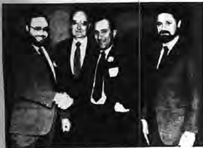
Honored by Jacobsen Division of Textron Inc. for excellence in product service during the past year was Maltese Mowers & Equipment, Inc., 530 Old Country Road, Hicksville.

National Westminster Bank USA, the wholly-owned subsidiary of National Westminster Bank PLC of London, has $8.7 billion in assets and 152 offices in New York City, Long Island and Westchester.