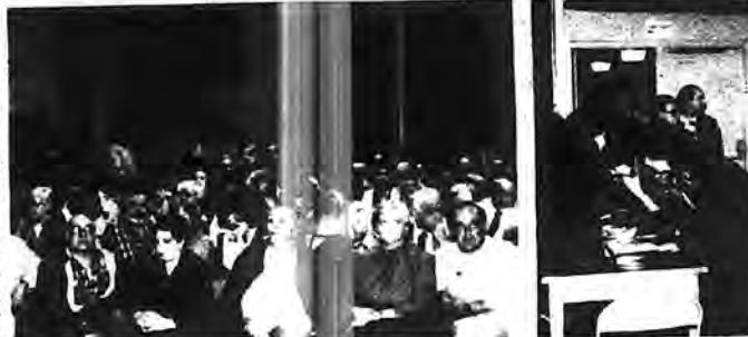
REBIRTH OF A CIVIC ASSOCIATION: an above-capacity crowd of North Hicksville residents attended the first meeting of the Midland Civic Association held recently at the Willet Ave. pool.