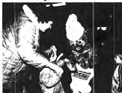
Children attending Trinity Lutheran Nursery School's annual pancake breakfast receive treats from Mr. Smurf!

February has been designated as Lutheran Schools month by the Lutheran Schools Association. Trinity Lutheran School, 40 W. Nicholas Street, Hicksville, will give special emphasis to this event by having Open House during the week of February 4-7.