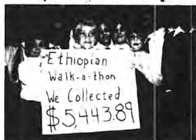
Pictured are the children who raised the most from their recent Walk-A-Thon for Ethiopia.

The temperatures were hovering at the freezing mark on the day that Holy Family School held a Walk-A-Thon and raised over $5,400 for the people of famine-stricken Ethiopia. Under the direction of Linda Brajevich, Physical Education instructor, over 695 students walked or jogged continuous 1/4 mile laps outside their school. Students in grades 5-8 had 2-1/2 hours to walk; the younger students (K-4) had 1-1/2 hours. Most students averaged 20 laps, and one student managed to do 31 laps.