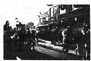
Santa arrives at Fire Dept. Open House in Hicksville.

DONOVAN REALTY 64 Jerusalem Ave. Hicksville, N.Y. 822-1222