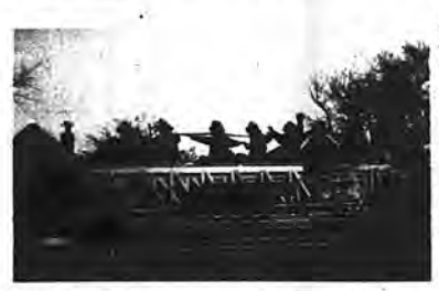
With a mild Christmas Season upon us Santa swaps his sled for a fire truck and 7 willing helpers (members of PH &