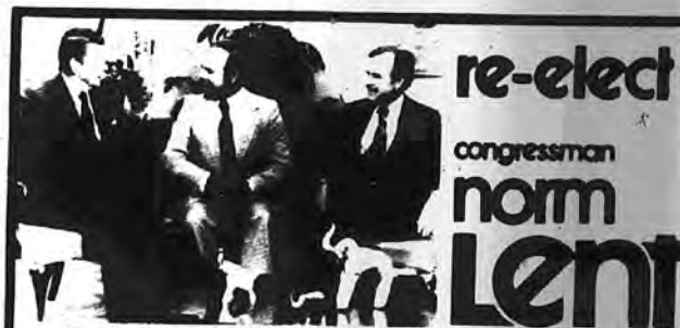
The Reagan - Bush - Lent Record:

Those desiring further information should call (516) 681-5400.