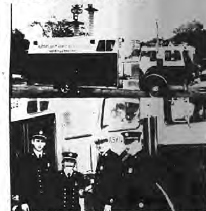
NOW DEDICATED: In the upper photo we see the new truck serving Hicksville - a Floodlight/Heavy Rescue, Company #8.

A special fire hazard involving leaves is the danger of parking automo-