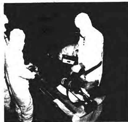
Doctors check with Geiger Counter for Radio Active contamination.