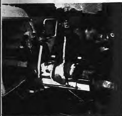
Injured driver removed by Corp members.