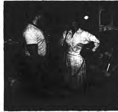
Local radio station reporter interviews one of the firemen at conclusion of the drill.