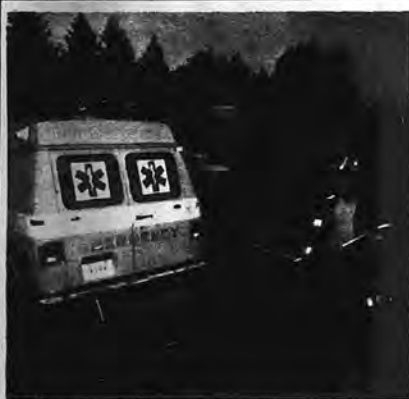
PFD Ambulance arrives at Central General Hospital.