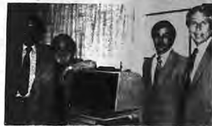
COMMUNITY COOPERATION: the three Service Clubs of Hicksville donated the "Electronic Colorizer" to the Hicksville Library recently. This machine enables print to be enlarged and read off the screen, thus enabling people with eye problems to read small print.