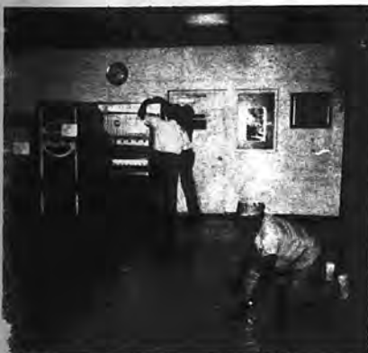
Emergency Room floor is cleared away and covered with special plastic sheet.