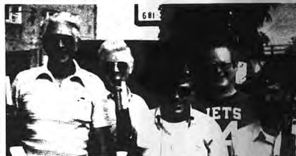
On a sunny Fourth of July morning spirits are high among these members of the Charles Wagner Post 421 of the Hicksville American Legion who were putting out our national colors

The Lodge was cited for its many community service endeavors for youth and veterans and for its fund raising efforts in behalf of a cerebral palsy in-home therapy program.