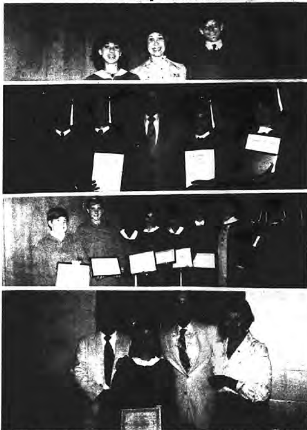
Eighth grade students of Trinity Lutheran School, 40 West Nicholas Street, Hicksville, were honored at commencement exercises held Thursday, June 21.