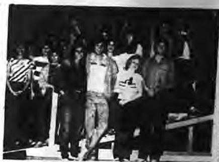
VARIETY SHOW AT HHS: An energetic company pauses from rehearsal of "Mack and Mabel". The show will be staged May 24, 25, and 26 in the Mabel R. Farley Auditorium of Hicksville High School. Tickets are $5.00 each.