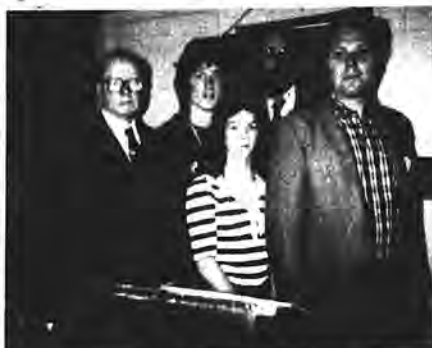
Area high school personnel gave an in depth report on the activities and aims of Students Against Drunk Driving (S.A.D.D.) to Hicksville rotarians at their weekly luncheon meeting in the Millbridge Inn last week.

There will be door prizes, raffles, boutique articles, and refreshments.