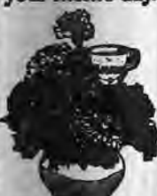
The Copper Bowl™ Bouquet from your FTD® Florist.