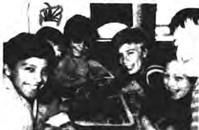
BUDDING M.D.s? Sixth graders prepare to dissect heart during Seattle-Berkeley project.

What valve connects the left atrium and the left ventricle? What kind of blood does the pulmonary artery carry? Don't know the answer?