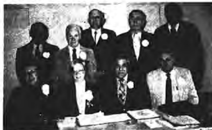
Officers of the Federal Association of Retired Federal Employees Nassau Chapter #471.