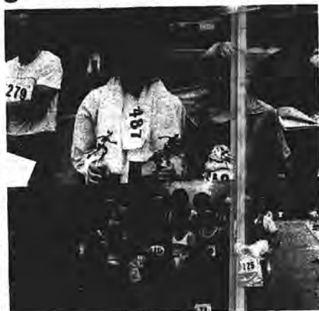
Members of the Plainview-Old Bethpage Road Runners Club are all smiles as they congregate just before the Syosset starting gun. [lower photo]

The race was something of a "family event" for Club