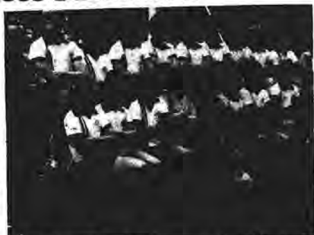
The Hicksville Yankees (boys under 17) brought the under 19 State Championship home to Hicksville for the 5th consecutive year with 8 consecutive wins against 19-year-old teams from all over New York State!!