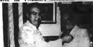
ANOTHER KIWANIAN is honored for an additional year of perfect attendance.